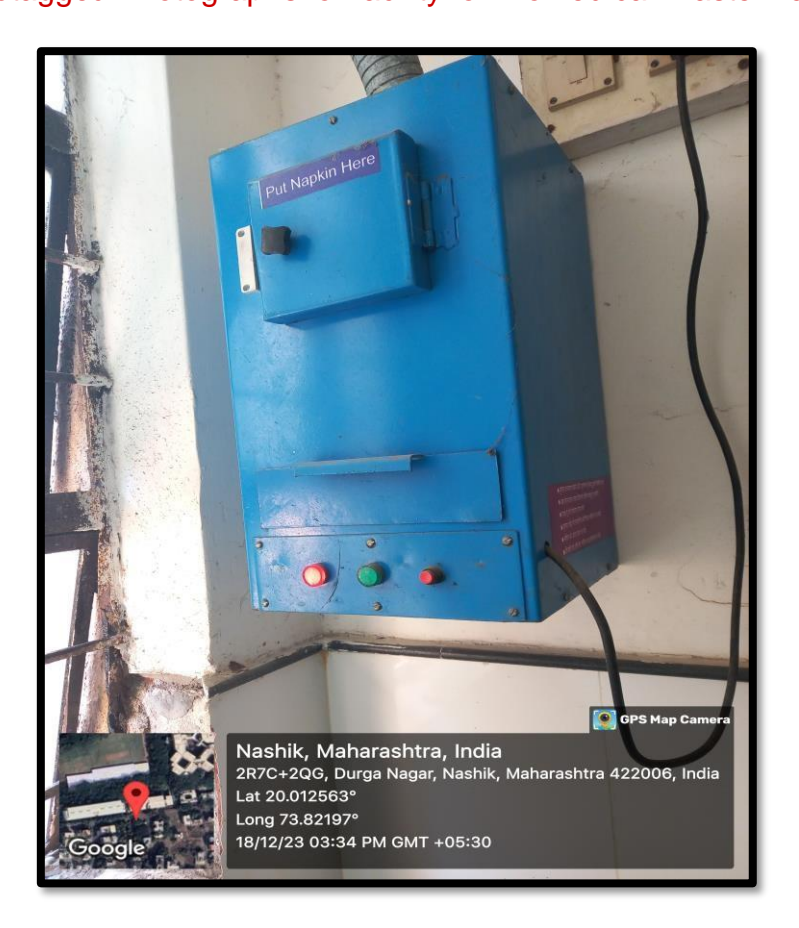
Disposal of biomedical waste