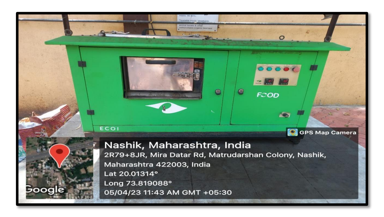
Bio waste management facility