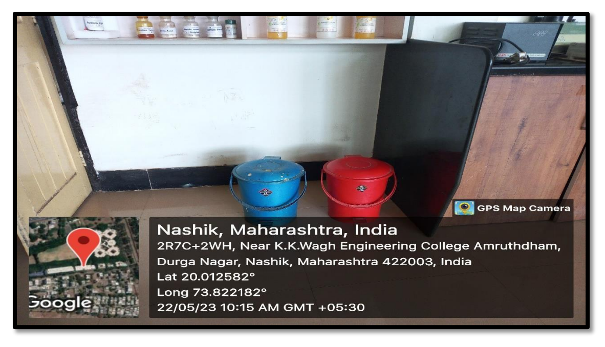
Two different colored dustbins for hazardous and non-hazardous waste